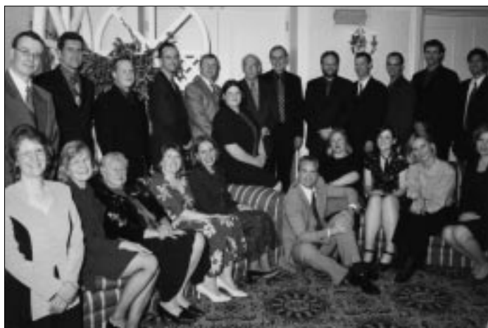
Current and former Canada West staff gather for a group photo at the Foundation's 30th Anniversary Celebration.