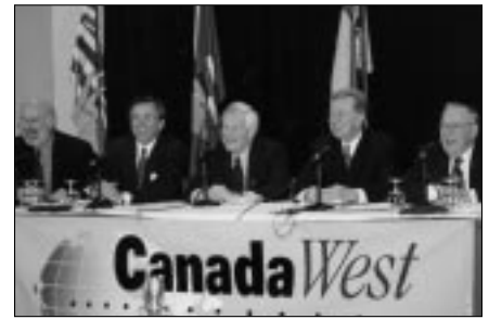
Speakers at the Western Builders Roundtable included Michael Harcourt, Gary Filmon, Peter Lougheed, Preston Manning, and Allan Blakeney.

Canada West Foundation's activities are not limited to producing research studies on important policy issues. Throughout the year, Canada West staff also travel across the country presenting the results of Foundation research and seeking feedback on current CWF projects. In addition, the Foundation has a long-standing tradition of providing forums, such as conferences and workshops, where citizens can engage in specific issues and meaningfully contribute to identifying alternatives and solutions to those issues. In 2001, Canada West sponsored the Western Builders Roundtable and a series of Provincial Consultations as part of the Building the New West Project . In addition, Canada West staff presented the results of CWF research and represented the Foundation at numerous events across Canada.