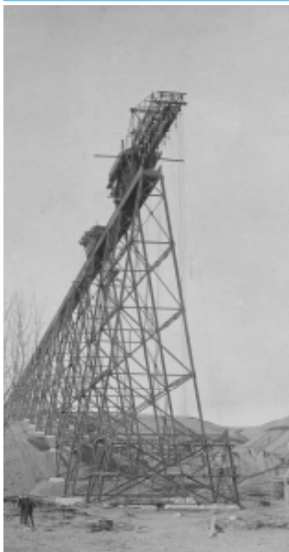
Construction of the CPR Bridge over the Oldman River at Lethbridge.