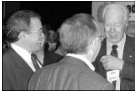
Former Manitoba Premier Gary Filmon meets with delegates to the Western Builders Roundtable .