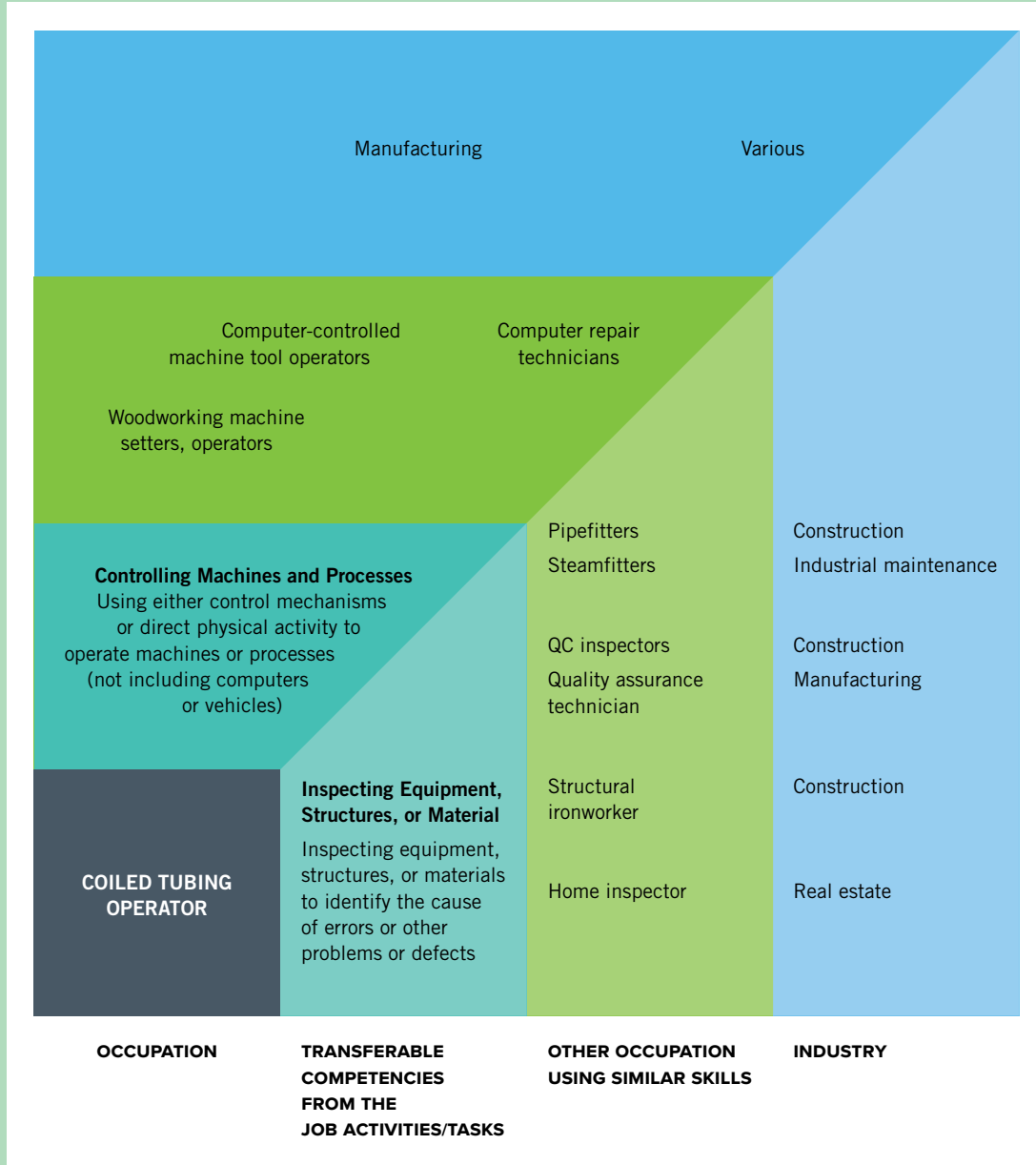
FIGURE 2: COMPETENCIES OF ONE OCCUPATION ARE USEFUL IN OTHER OCCUPATIONS ACROSS MULTIPLE INDUSTRIES